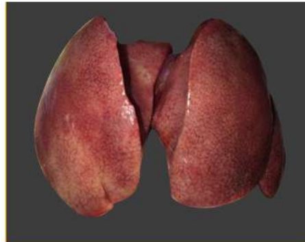
Hepar R3 treated liver